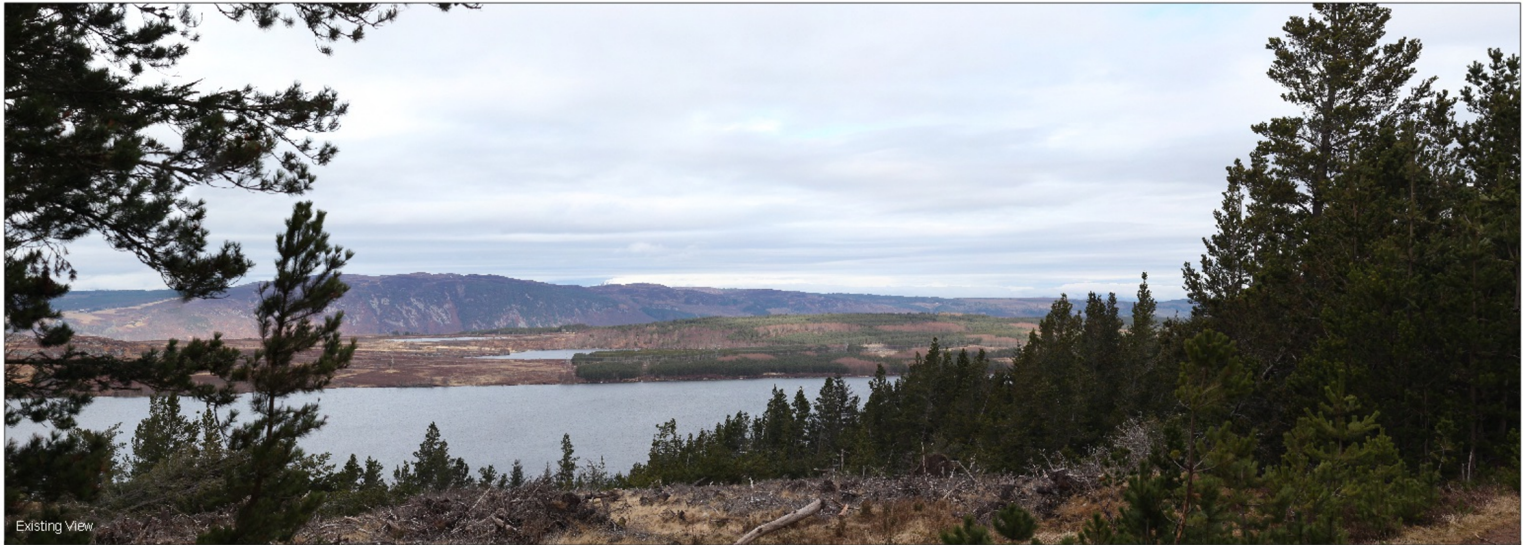
Viewpoint 5 : Trail of the Seven Lochs between Loch Duntelchaig and Loch a'Choire

Camera: Canon EOS 5D Mk II Focal Length: 50mm Horizontal Field of View: 65.5° Camera Height: 1.5m Date: 27/03/18 Time: 10:40:00 Distance to Headpond: 2.9km Distance to Tailpond: 4.6km